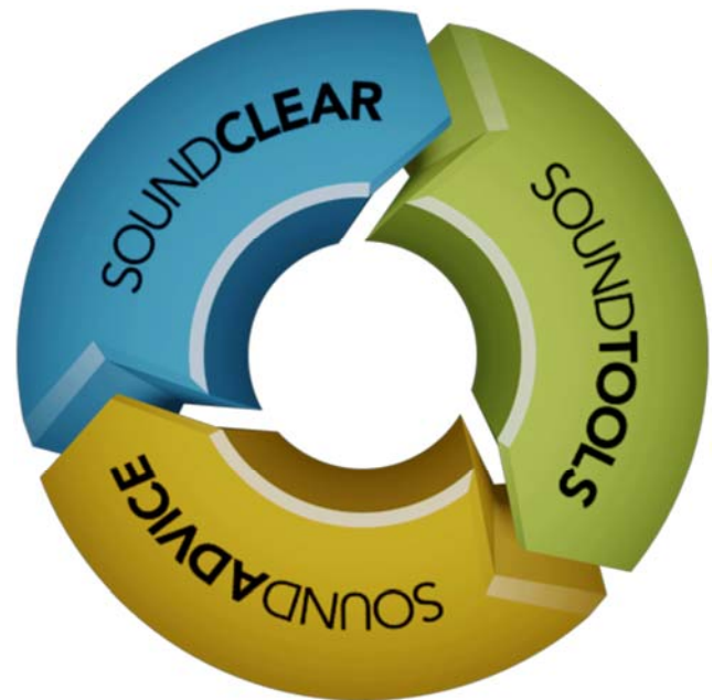
Unwanted Echo and Noise Removed with SoundClear ATS6340 Solution