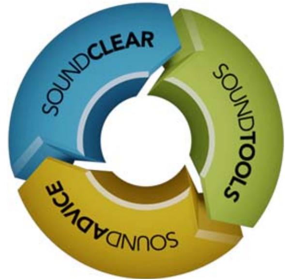
Unwanted Echo and Noise Removed with SoundClear ATS6130 Solution