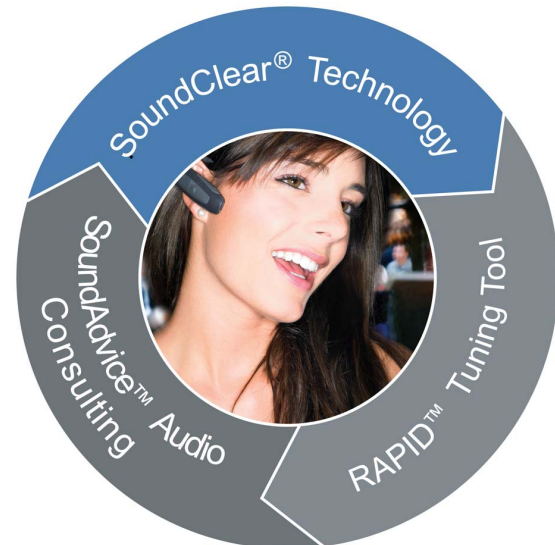
Unwanted Noise Removed with SoundClear Multi-stage Beamforming